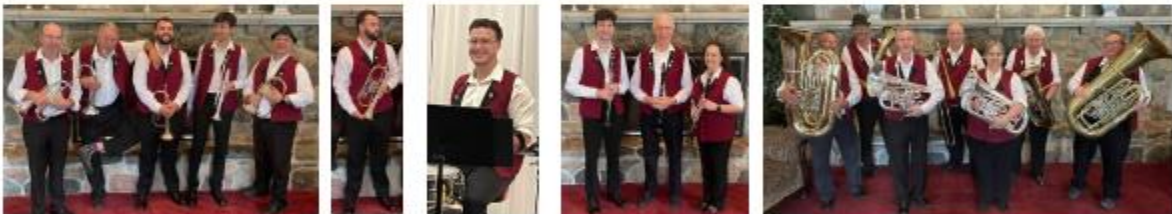
11 th Annual Spring Concert – Theme: Frühlingsgefühle